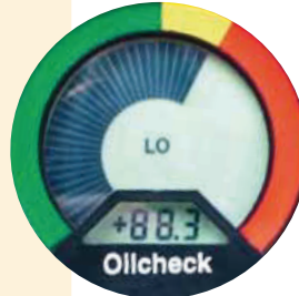
Green/amber/red numerical value