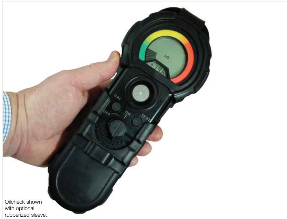
Oilcheck shown with optional rubberized sleeve.

Parker's Oilcheck is completely portable and battery powered with a numerical display that indicates positive or negative increase in dielectrics. Oilcheck gives an early warning of impending engine failure and the simplistic hand-held design makes it easy to use.